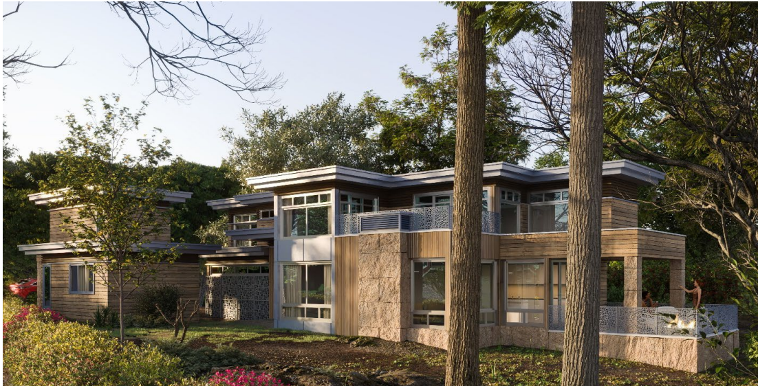
Rendering of proposed dwelling with coach house

New Two-Storey Single Family Residence with a Coach House 4798 The Highway, West Vancouver